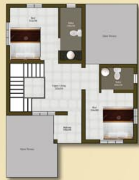
Type - A

Ground Floor : 894 Sqft First Floor : 617 Sqft Total Area : 1511 Sqft