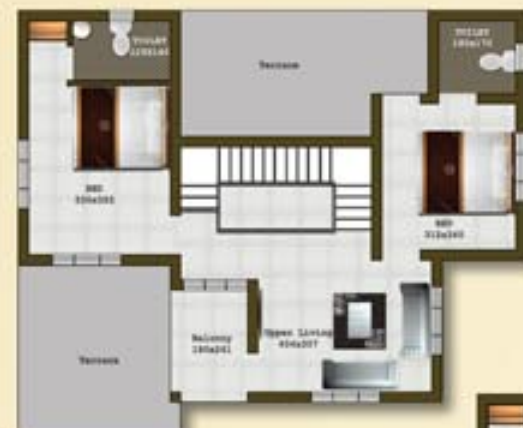
Type - B

Ground Floor : 1125 Sqft First Floor : 802 Sqft Total Area : 1927 Sqft